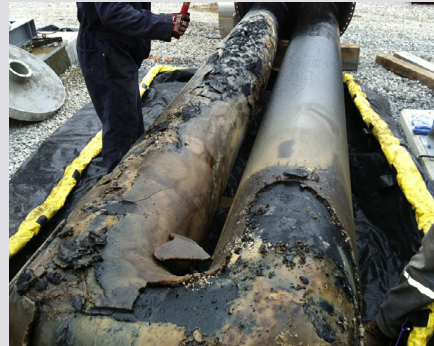
Before: Scale buildup and corrosion from commodity TEG.

Increased chloride levels in the glycol indicates more salt is held in the system versus deposited, reducing the likelihood of buildup, corrosion and unnecessary downtime.