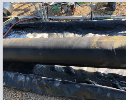
After: Equipment after operating with NORKOOL DESITHERM™ HS for roughly 15 months.